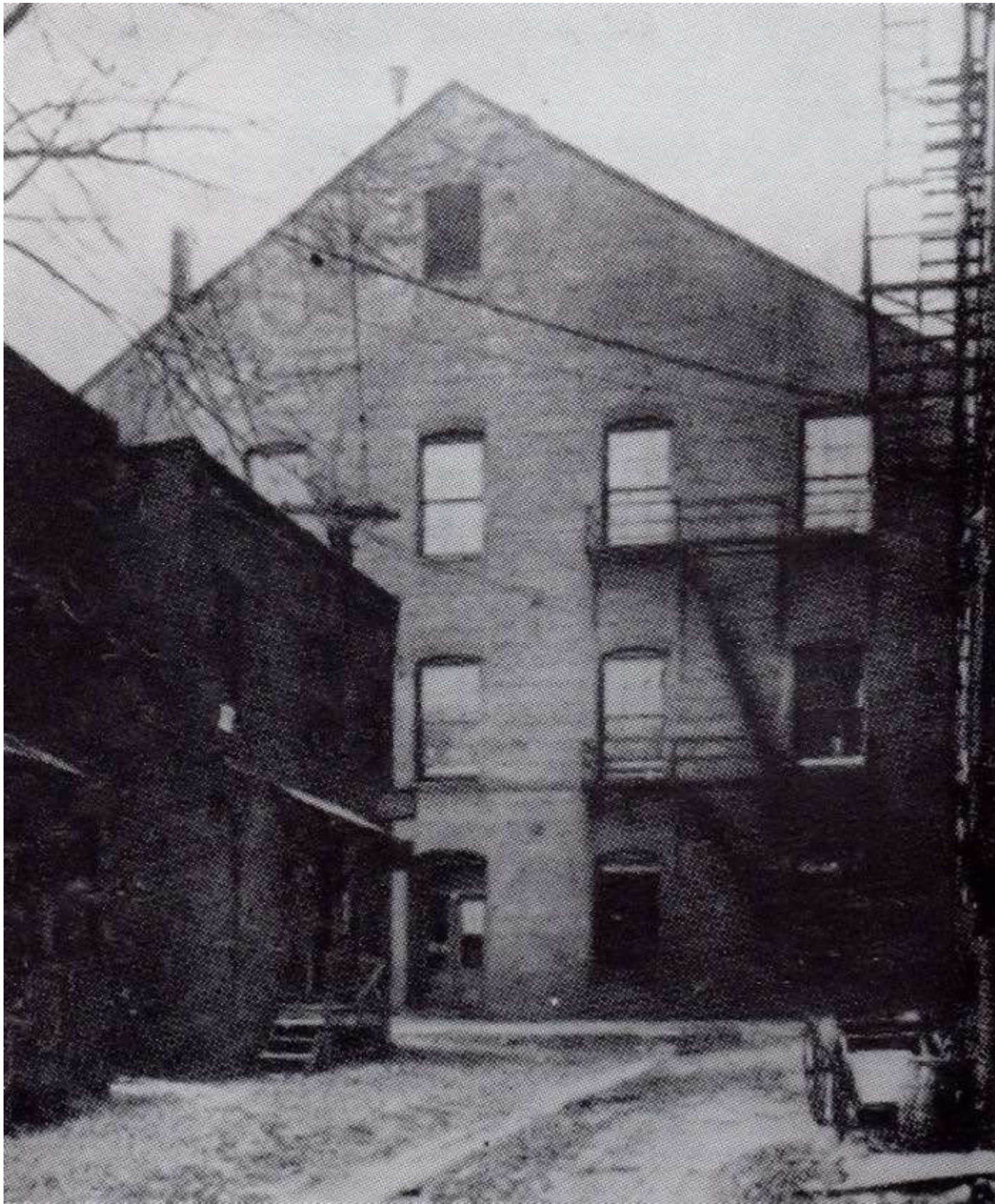
The rear view of Ford's Theater and 'Baptist Alley'

The attack on Seward has been all but written out of our history books, but in 1865 it was portrayed as an integral component of the