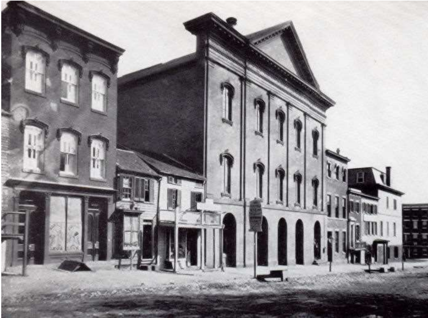
Ford's Theater, circa 1865

You're not on a suicide mission, by the way, so even if you somehow manage to successfully assassinate the president, and presumably General Grant as well, you're still going to have some major problems on your hands. First of all, you're going to have to make your escape from a theater full of people, many of them armed.